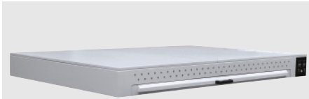
DuPont™ Cyrel® 3000 LF